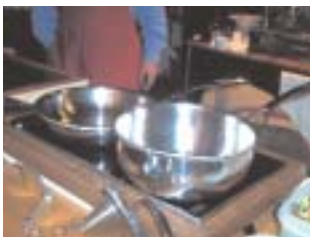
Atlantis saucier and frying pan

To update your details, send us your name, postal and email address to info@artoflivingcookshop.co.uk , drop them in to the shop, or telephone them through on 01737 242302.